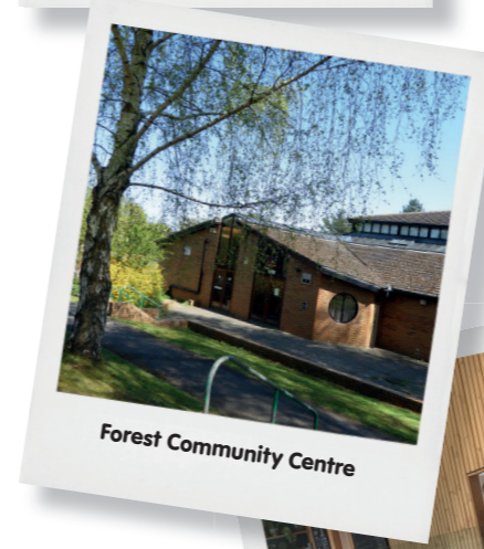
Forest Community Centre