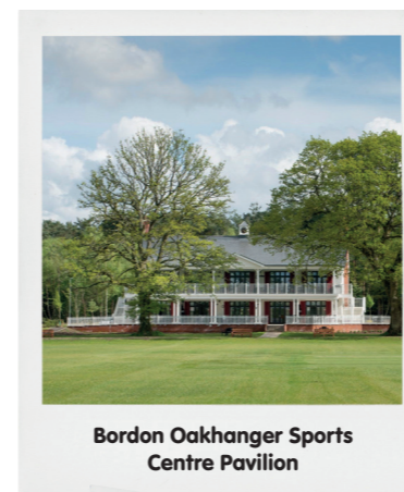
Bordon Oakhanger Sports Centre Pavilion

For more information, visit myjourneyhampshire.com/wheels-work or email mopedloan@cfnf.org.uk